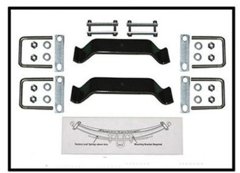
SuperSprings Mounting Kit # MTKT Installed ———