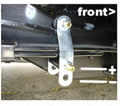
set spring pre-load & ride height

Refer to SuperSprings application guide for part selection www.supersprings.com [Tech line #866-898-0720] SuperSprings enhance load carrying capability, handling & towing. Never exceed vehicle manufacturer's GVWR rating.