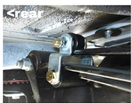
SSA14 short shackle , allow 1/2" spacing roller to leaf

disassemble front shackle re-assemble frame side while mounting