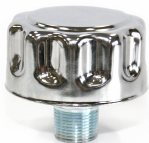
BOUCHON VENTILÉ BREATHER CAP #HBF12