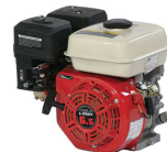
MOTEUR À ESSENCE GASOLINE MOTOR