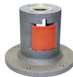
SUPPORT D'ACCOUPLMENT BRACKET #89936996 (7 HP) #89936998 (9 HP)